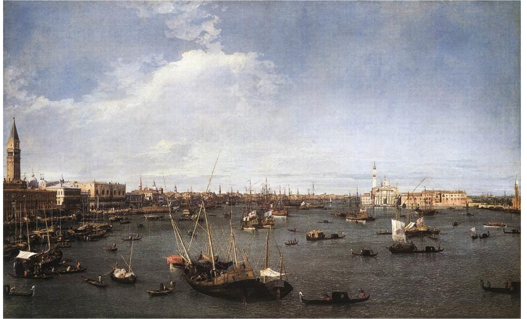
Canaletto, Il Bacino di San Marco verso est (1730 circa, Boston, Museum of Fine Arts)